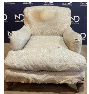
Armchair by Howard & Sons original ticking, cabriole legs castors & Maker's mark – Sold for £4,400