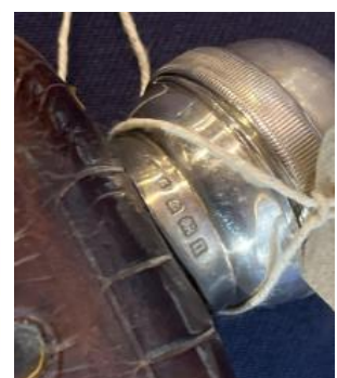
Silver crocodile leather hip flask and beaker – Sold for £220